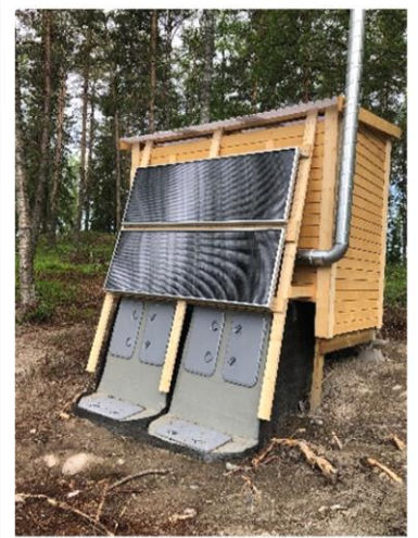
In one of the LONA projects a solar powered toilet is tested.