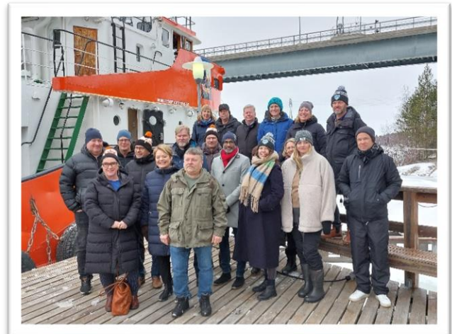
A "high level" meeting in Piteå about cooperation and

Don't hesitate to contact us to find out more about our work! You will find contact information at our webpage .