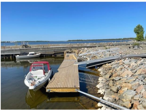
LONA: At Gåsören a new jetty contributes to better accessibility adaptation at the destination.