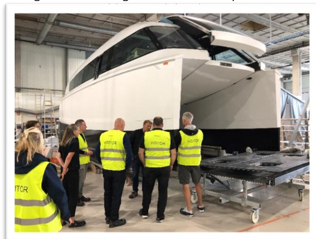
Region Stockholm and Candela have an interesting project about electrical powered boats.