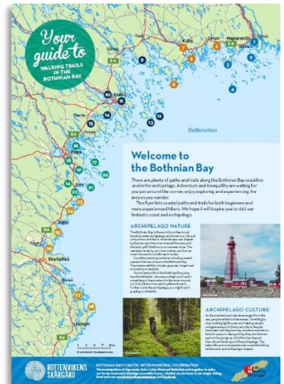
LONA: An inspiring map showing walking trails in the coastal area.

In Piteå archipelago, the sauna at Fingermanholmen has been stabilized with a new foundation. Mooring loops and toilet paper holders with the Bottenvikens skärgård logo can now be found in the Piteå sailing association's harbour and a new barbeque area has been arranged at Mellerstön.